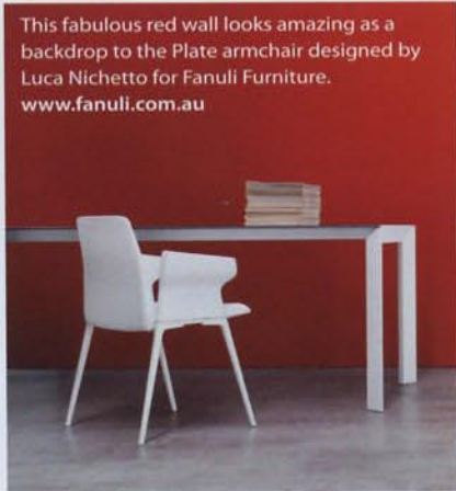
This fabulous red wall looks amazing as a backdrop to the Plate armchair designed by Luca Nichetto for Fanuli Furniture. www.fanuli.com.au