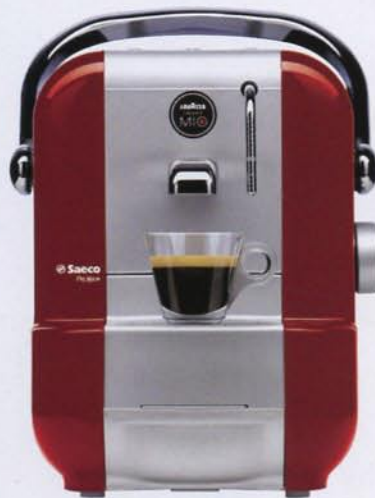
BELOW My morning coffee always tastes better from my Lavazza A Modo Mio coffee machine and it's a great contrast to my all-white kitchen. It's trendy, colourful, compact and easy to use, with pre-measured coffee capsules. And there are no messy coffee grounds to dispose of. www.lavazzamodomio.com.au