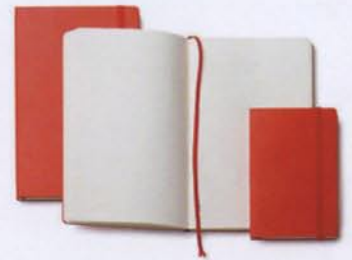
ABOVE The Moleskine notebook was created as a brand in 1997, bringing back to life the legendary notebook used by artists and thinkers over the past two centuries, including van Gogh, Picasso, Hemingway and Chatwin. This travel companion held the notes, sketches and story ideas that would become famous. Today, Moleskine notebooks are again the trusted companions of the creative professions. Mine is permanently housed in my bag, at the ready for any editorial or interview opportunity. www.moleskine.com