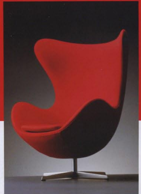
ABOVE The Egg chair from 1958 was developed for the lobby and reception areas at the Royal Hotel in Copenhagen, designed by Arne Jacobsen in the late 1950s. This iconic design is as popular today as ever and can be found in many residences, as well as commercial projects, around the world. It looks wonderful in my living room teamed with a couple of black Barcelona chairs. www.corporateculture.com.au